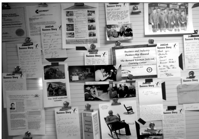
JobLink's Success Board: Come in to see it!