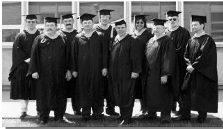
Students graduate from Calumet College with tuition assistance from JobLink